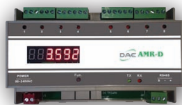
AMR-D 8 Channels