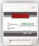
AMR100-D Single Channel